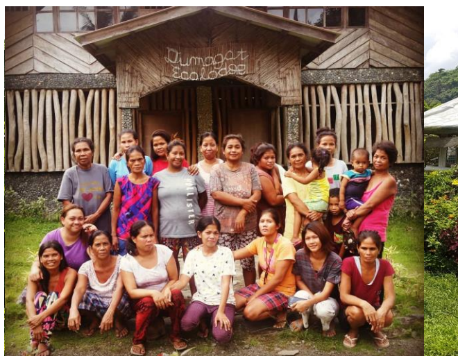
Dumagat farmers from Barangay Daraitan, Tanay, Rizal during their UPLB Tour and market exposure in 2017.

pricing, components, which Che noted, were often missing in most livelihood programs. She received funding in December 2016. She chose Barangay Daraitan in Tanay, Rizal as a project site because of its accessibility, the presence of sources of water, and most of the community members are farmers. She allotted a portion of the UNDP funds to build a structure called Bahay Tipunan at Libreng Paaralan (Meeting Place and Free School), which the farmers can use for various purposes: as a place where they can sort their harvests, as a meeting place, and as accommodation for tourists for a minimal fee. The latter provides additional income to the farmers.