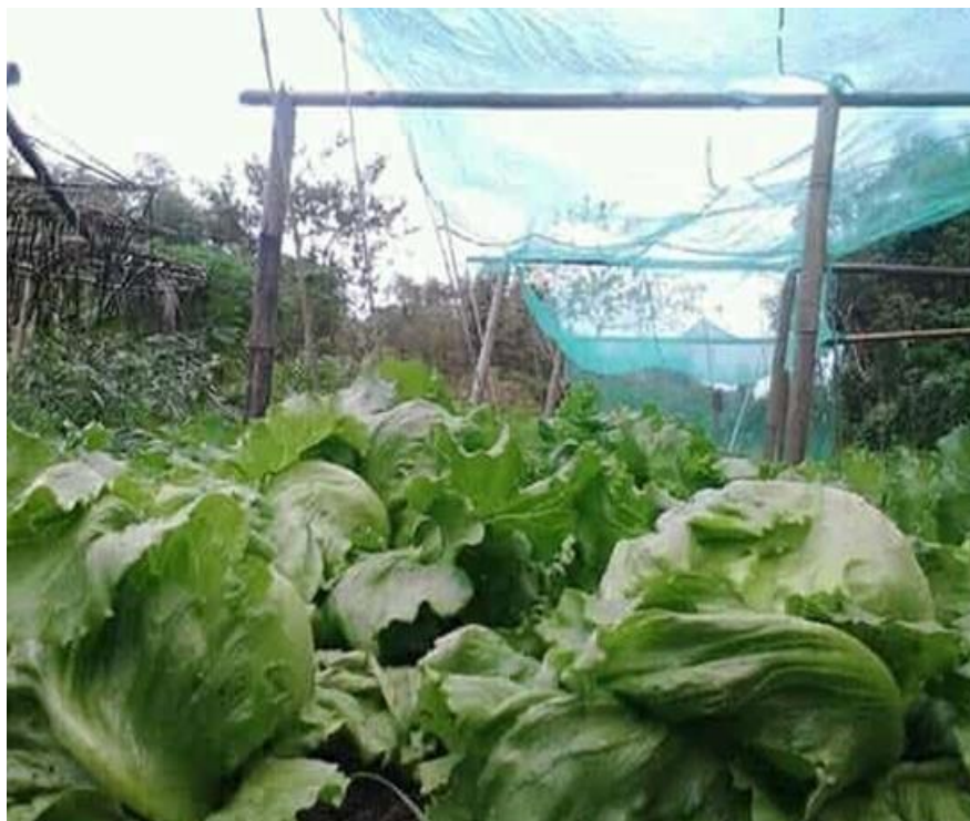
Aiza introduced lettuce in her community. She wrote her thesis on lettuce and she applied what she learned from her research when she ventured into lettuce growing.