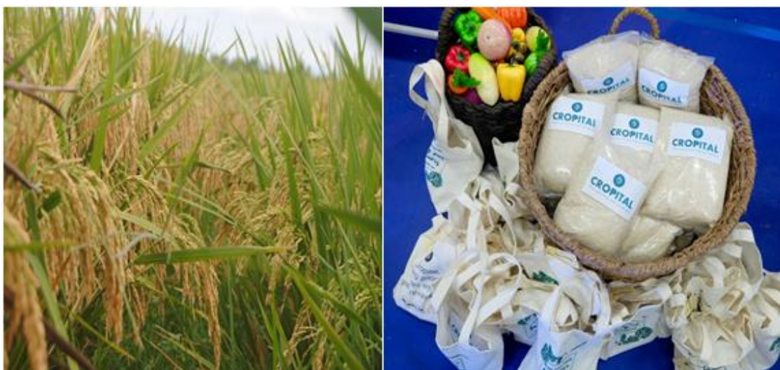
Promise of a good harvest (left) and rice packets from Bulacan farmers (right) on display during the 2016 IdeaSpace Demo Day.

Thus far, Cropital has released PHP 40 million to more than 500 farmers with a repayment rate of 94 percent (as of February 2019).