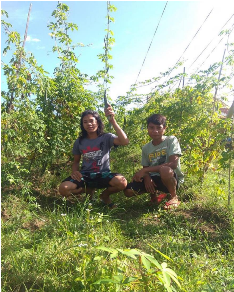
Two of the 2018 batch of young trainees tending their plots.

Every batch has 4-6 trainees. Up until now, all the trainees had been male, mostly because the facilities cannot accommodate both male and female participants. The training is free, thanks to the support provided by APLA. The trainees do not receive an allowance. They can earn from the sale of vegetables they grow in their assigned plots or the pigs under their care.