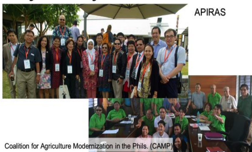
Coalition for Agriculture Modernization in the Phils. (CAMP)