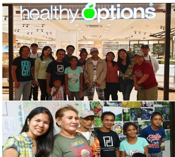
Dumagat farmers from Rodriguez, Rizal during their market exposure and visit to Good Food Community, Inc. in Cubao, Quezon City in 2019.

The CSA promoted by Sierreza is not identical to the CSA of Good Food Community, Inc. (GFC) (see GFC in this series). Che tweaked the CSA in Los Baños: (1) the payment in Los Baños is postpaid, a scheme preferred by the community after doing a trial run of prepaid subscriptions; 2) subscribers get to choose what they want to buy from the available produce posted in the Sierreza Facebook page; 3) most of the produce sold by Sierreza are not upland produce (rice is from Antipolo and fruits are from Barangay Daraitan); and (5) subscribers pick-up the produce from the store and delivery is for special circumstances only.