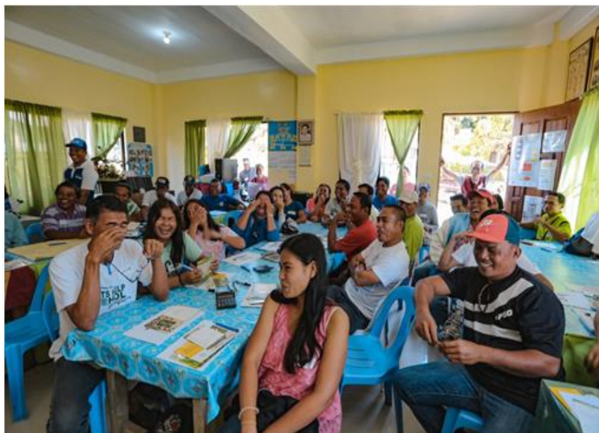
Cropital provides financial as well as technical support to farmers.

Cropital focuses on funding rice growing farmers in selected provinces: Batangas, Bohol, Bulacan, Laguna, Leyte, Pampanga and Pangasinan. The Visayas provinces were additions in 2018. For now, Cropital is limiting its operations to these provinces while trying to improve the model and the system. The partner farmers of Cropital are males and females between 25 and 75 years old, and smallholder farmers with 0.5 to 4 hectares of land.