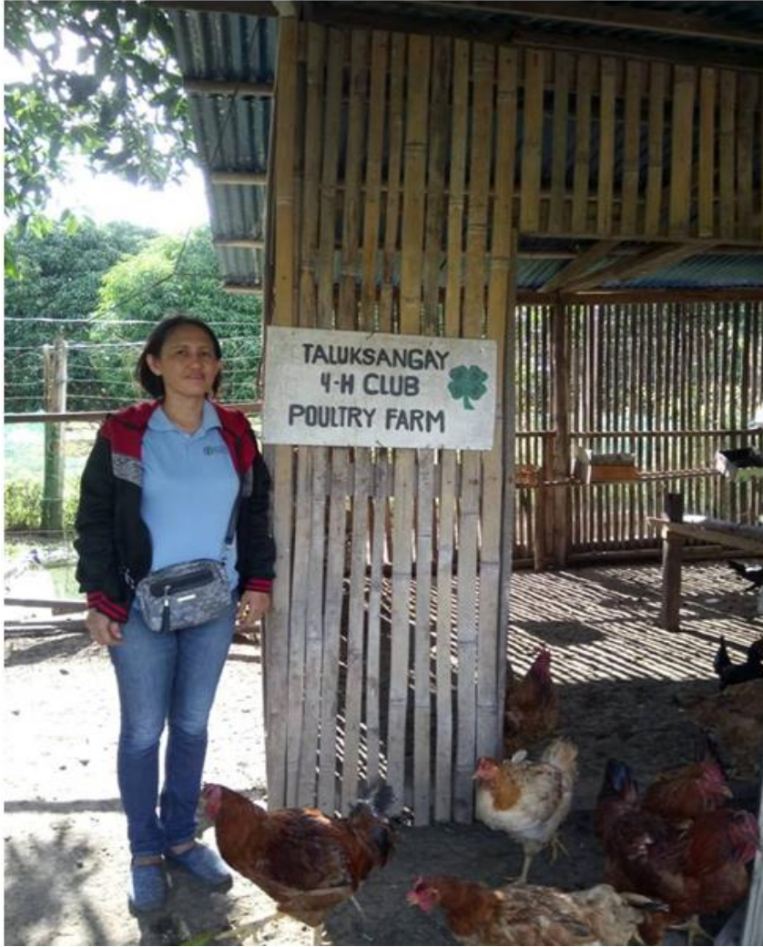
The club's farm has 17 goats and 80 chickens (as of November 2018).