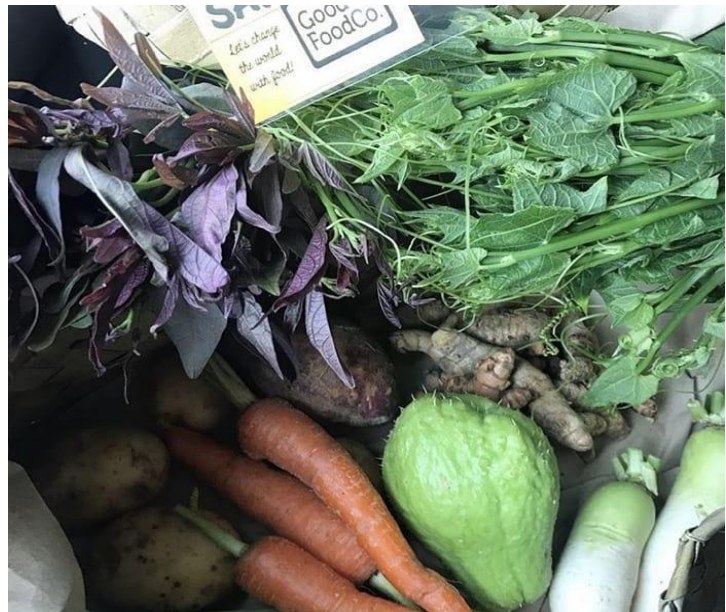
GFC gulay (vegetable) shares in bayong (small sack).