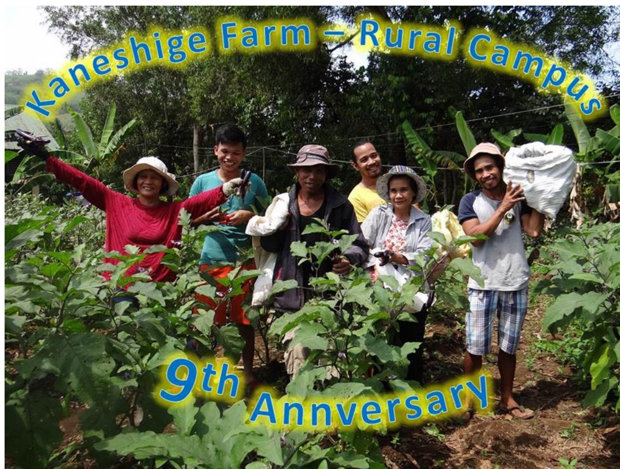
The KFRC staff celebrating their 9th anniversary in July 2018.

Since its inception, the training program of KFRC was oriented to the training of young farmers in the province of Negros Occidental. In the past, the program also accepted young people who had completed college education, but they noticed that some were just after the certificate of completion. 20 Also, since the program is supported by a Japanese NGO, some applicants thought that the training program will be a way to go to Japan. Thus, they considered restricting the program to those not in school who are more likely to be in need of training and employment options. The selection criteria also include being nominated by a people's organization and the candidate's family must have a farm. The latter criterion has wisdom: having a family farm means that graduates of the program can apply what they have learned from the training, and the family farm will benefit from new knowledge and techniques acquired by the trainees.