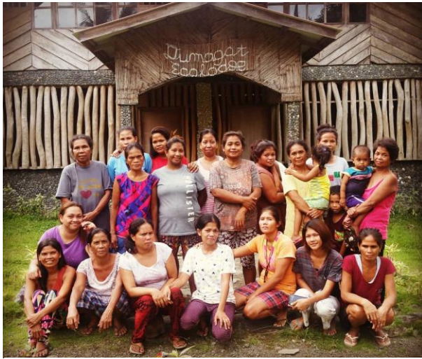
Katutubo (IP) in General Nakar, Quezon.