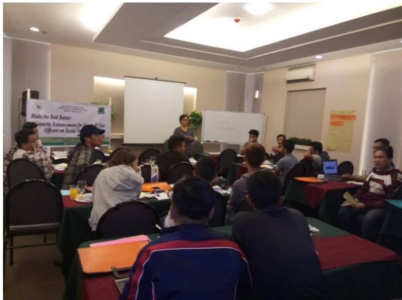
Introducing the KAYA-Agri Project to the national officers of 4-H Club Philippines.

Through multi-level meetings and competitions, members of different 4-H clubs meet and share their activities. Competitions are like talent searches where outstanding, innovative and best practices and initiatives are discovered. In the Department of Agriculture's annual search ( Gawad Saka ) for outstanding young farmer/fisherfolk and outstanding young farmer/fisherfolk organization-awards conferred to those who have contributed to the development of agriculture and