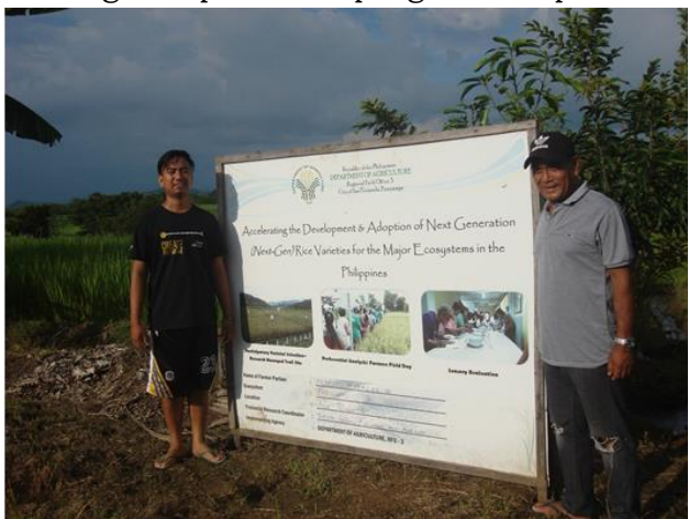
Son and father in their family farm in Palayan City.