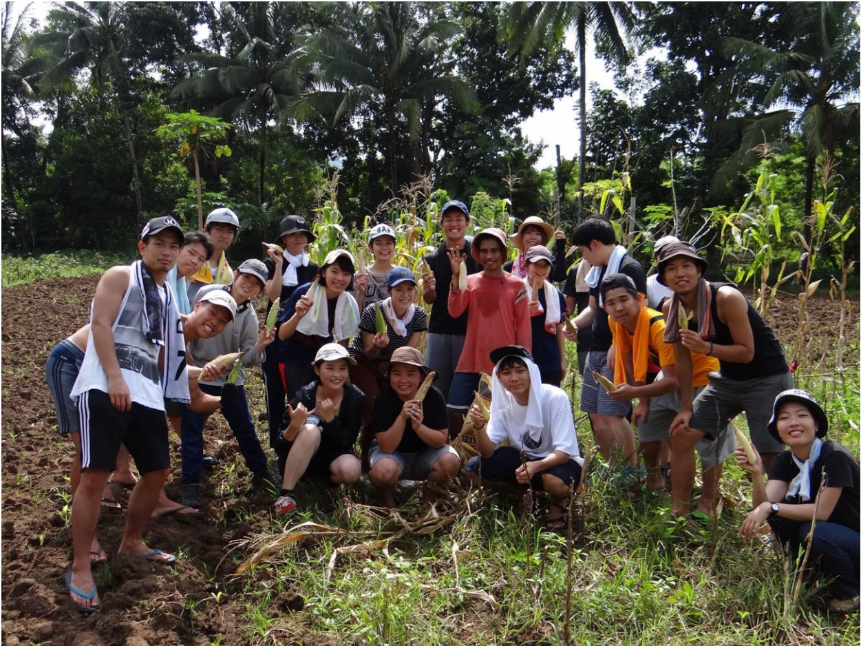
KFRC regularly hosts Japanese students who volunteer during their visit. These students are Nihon University.

The trainees are looking forward to the completion of their training program in March 2019. Hopefully, the four will be part of the next generation of farmers who will contribute to sustainable farming and will also be amply rewarded for their contributions.