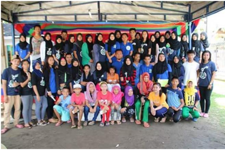
Taluksangay 4-H Club members during the national evaluation for Gawad Saka in August 2016.

The 4-H Club now is under the leadership of Sajir Omar. As had been mentioned, the club has ventured into buying and selling seaweeds. The club continues to participate in city and regional 4H camps and trainings in food processing and aquaculture.