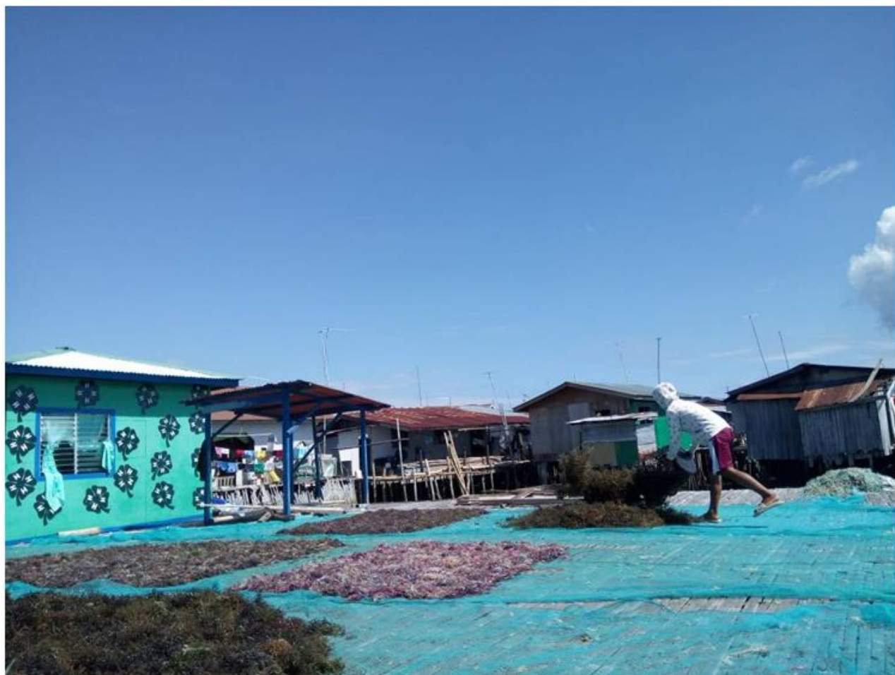
Members who are involved in various aspects of seaweed farming, including drying the seaweeds.

Earnings from the club's seaweed farming and entrepreneurial activities are deposited in a bank account. The members have the chance to enjoy their earnings during the Hari Raya Eid al-Fitr, an important Muslim festival which marks the end of Ramadan.