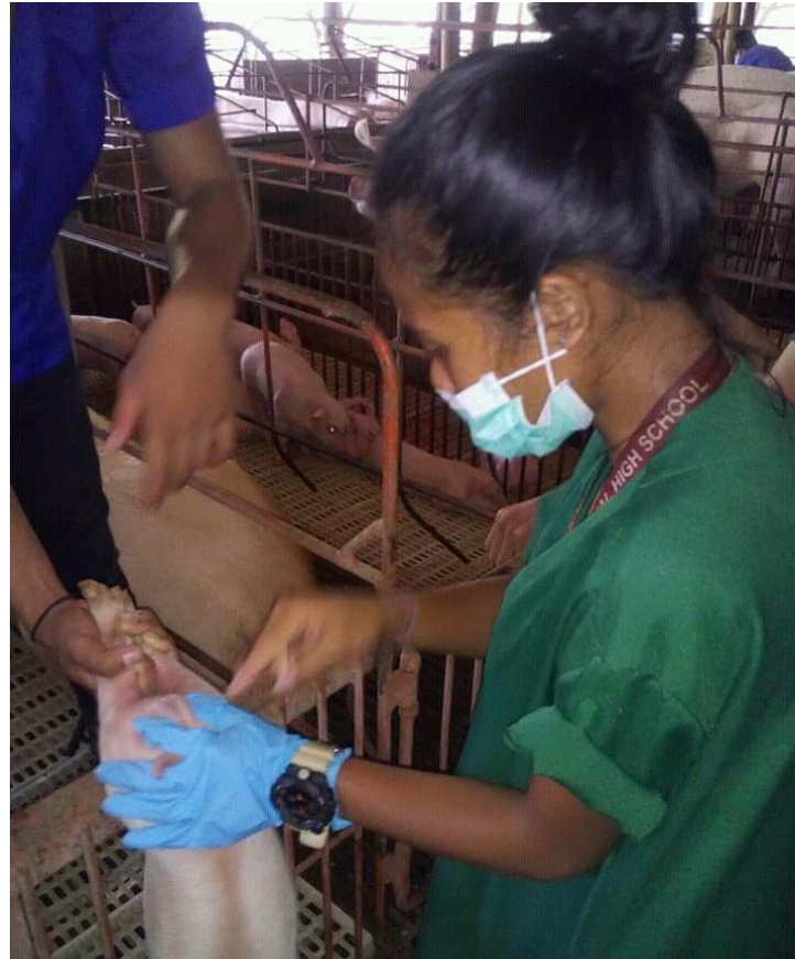
A senior high school student gets hands-on training in animal production at KFRC.