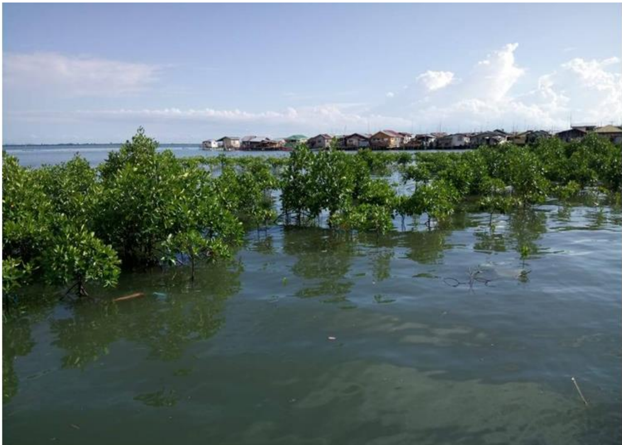
Mangrove planting is one of the club's community projects.

4-H members are exposed to several agriculture-based livelihood trainings, such as goat production, poultry raising, baking and the use of coconut by-products. The members also avail of other training activities sponsored by the Department of Agriculture, Department of Science and Technology and Department of Trade and Industry. In addition, the club pursues several self-enhancement and training activities. Apart from the holding of summer camps, which is a major draw for the new recruits, members participate in community development and leadership trainings like the six-month training on functional English. The members also participate in social and community development programs. These include teaching the Qur-an (Madrasa School), participating in the campaign against drug addiction, and planting mangrove trees. The club is also active in the weekly cleanliness and sanitation program of the community.