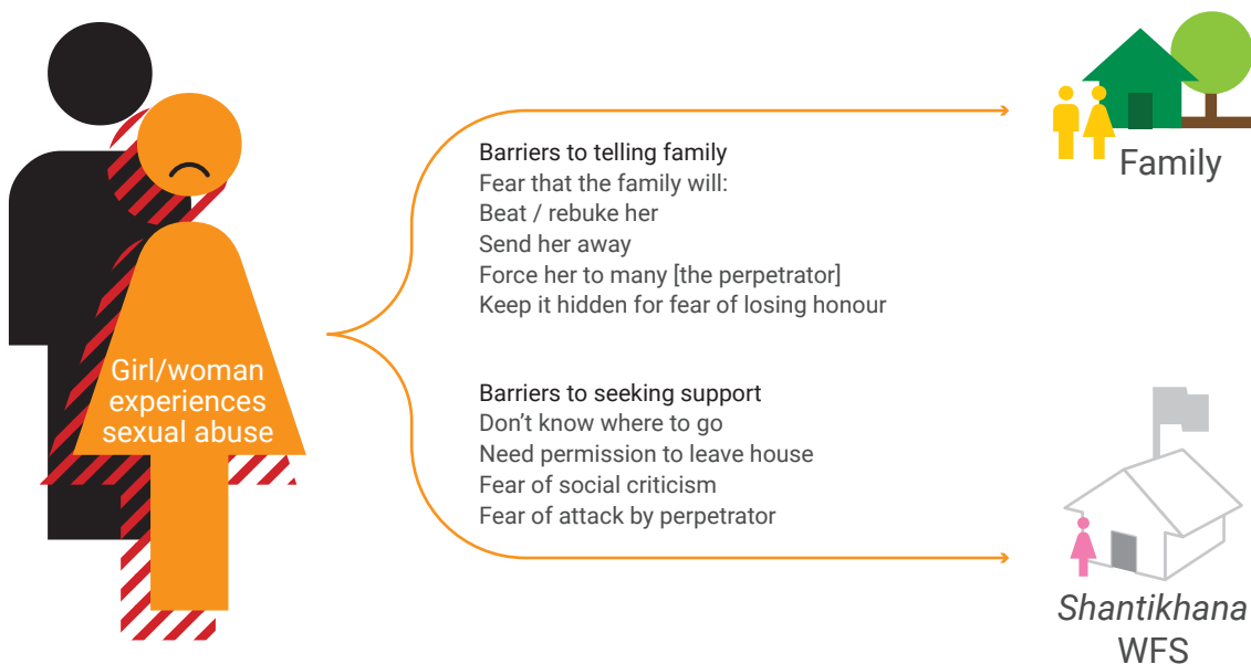
DIAGRAM 4: BARRIERS TO SEEKING SUPPORT IN SEXUAL ABUSE CASES